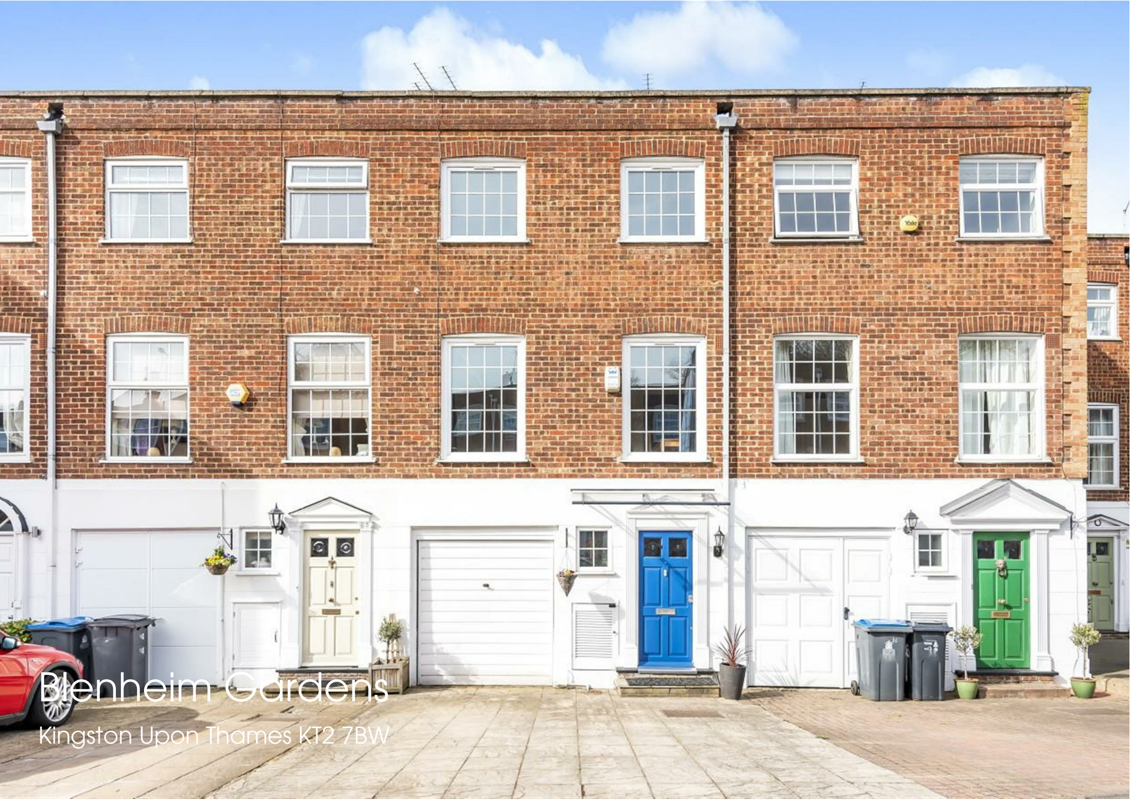
Blenheim Gardens Kingston Upon Thames KT2 7BW